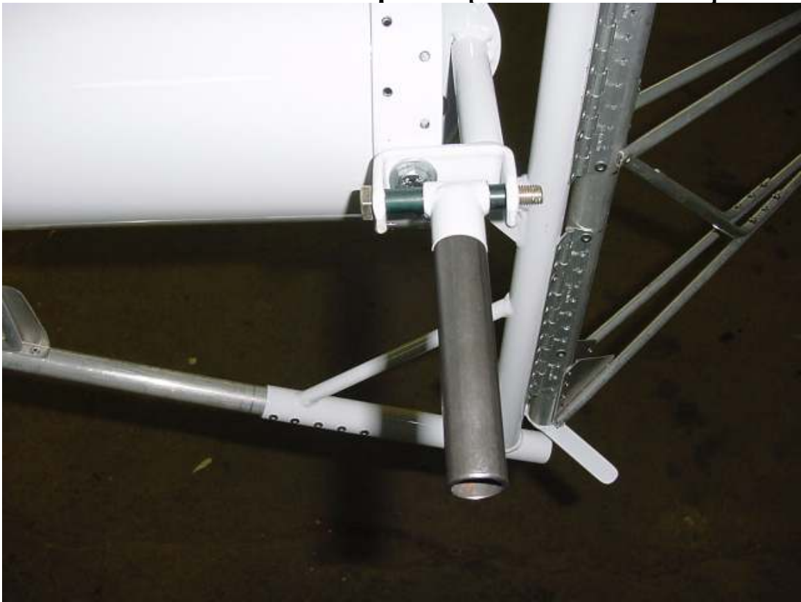
Begin new elevator construction